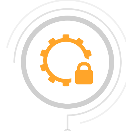
Web App Security