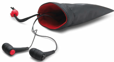
ThinkPad® In-ear Headphones (57Y4488)