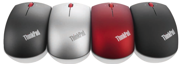
ThinkPad Precision Wireless Mouse - Midnight Black 0B47163; ThinkPad Precision Wireless Mouse - Heatwave Red 0B47165; ThinkPad Precision Wireless Mouse - Frost Silver 0B47167; ThinkPad Precision Wireless Mouse - Graphite Black 0B47168; ThinkPad Precision USB Mouse - Midnight Black 0B47153