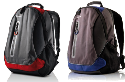
Lenovo Sport Backpack (0A33896 - Red); (0B47298 - Blue) ; Lenovo Sport Slimcase (0A33897 - Red); (0B47230 - Blue) ; Lenovo Sport Messenger (0A33898 - Red); (0B47299 - Blue)