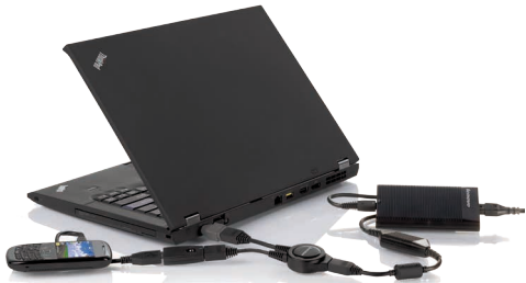
Lenovo 90W Ultraslim AC/DC Combo Adapter (41R44xx)